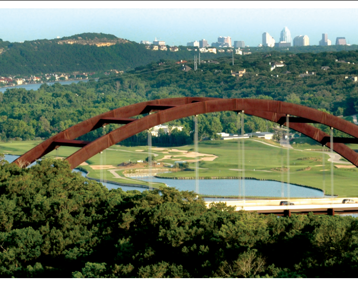
A bridge for the Public Sector to Security and Safety Technology

Austin Biometrics LLC is a Texas certified W/O HUB, offering security and safety products to the public sector.